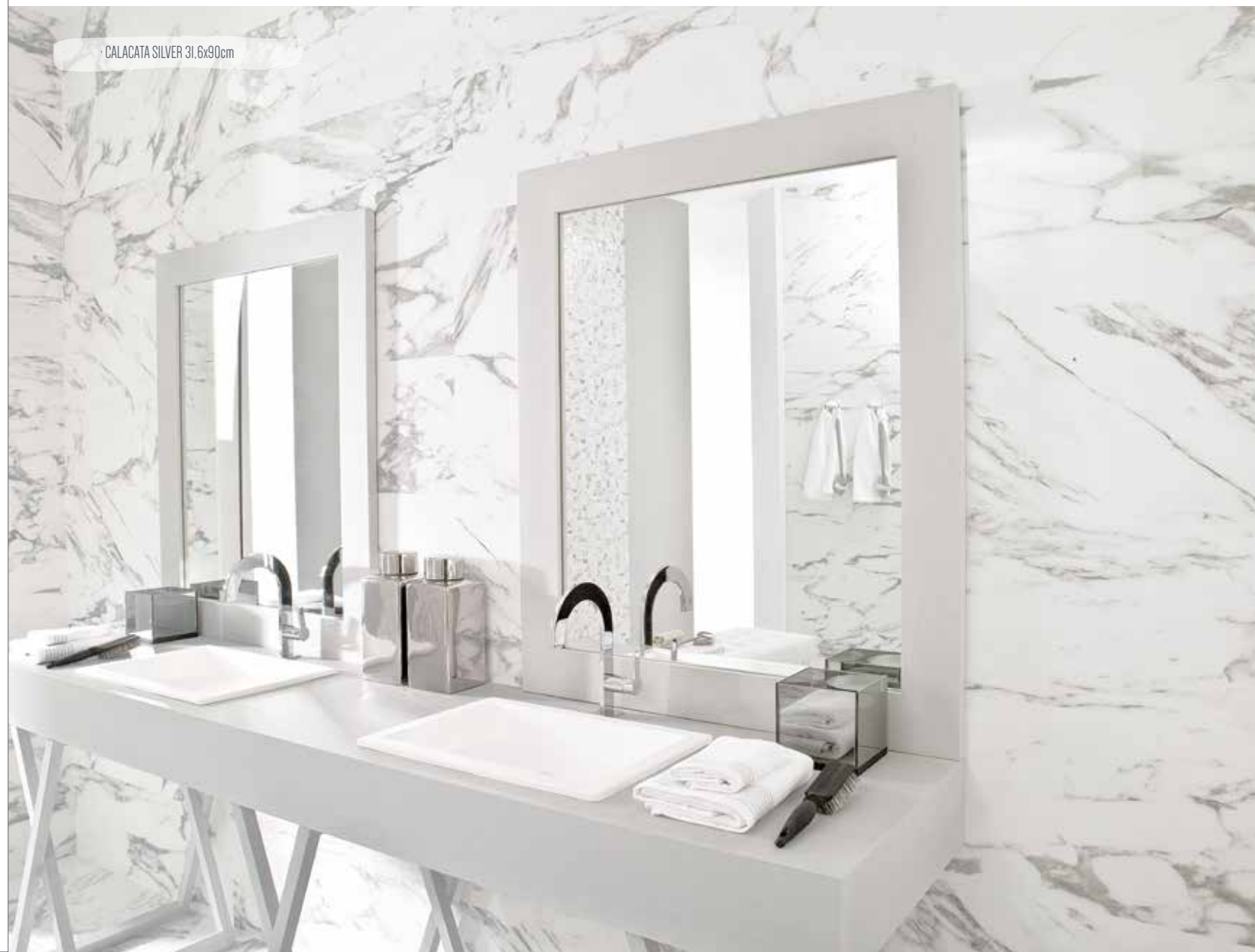
· CALACATA SILVER 31,6x90cm