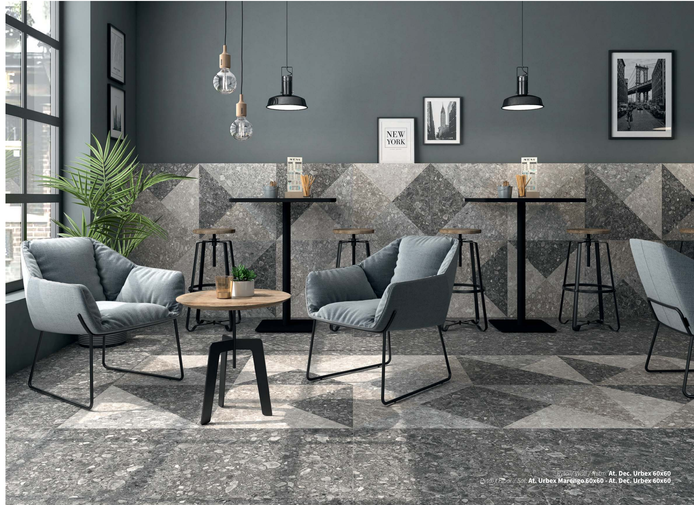
Pvto. / Wall / Rvfm: At. Dec. Urbex 60x60 Pvto. / Floor / Sol: At. Urbex Marengo 60x60 - At. Dec. Urbex 60x60